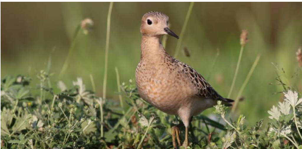
Juvenile Buff-breasted Sandpiper migrating from Canada to S. America.

In this issue we are providing a few salient updates. We are still hard at work in our gardens and were able to provide some lucky kids with "the best day ever". We have information on our annual birdseed sale, which is only a few weeks away already. Last but certainly not least, we have had a numbers of wonderful volunteers stepping up to the plate to help the board and its various committees. Four of them were sworn in as directors this summer! We are thrilled to have them on board. We also have a few goodbyes to three directors whose terms ended in June. One of them is yours truly. It has been a delight to share updates with our loyal readers, and I look forward to being involved in new capacities in the future. Thank you all.