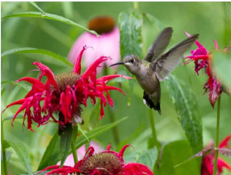
Ruby-Throated Hummingbird on Bee Balm

Hummingbirds are efficient pollinators. Every day our ruby-throated hummingbirds eat several times their weight in nectar, pollinating neighboring flowers in the process. Additionally, they supplement their sugary diet with small insects. According to the Cornell Berry Team, “A female ruby-throated hummingbird feeding her young can consume about 2,000 tiny, soft-bodied insects per day -- that’s a lot of the invasive spotted-wing drosophila, or aphids, or gnats or tiny spiders!”