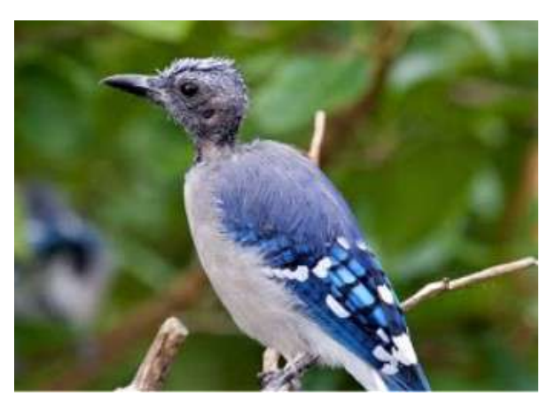
A healthy Blue Jay missing a few of its finest blue feathers on its head and neck.

Like human hair or fingernails, feathers are basically "dead" structures. Over the year, they become worn and damaged and need to be replaced. Like clockwork, the old feathers fall out in a specific sequence and the brand new feathers grow in. This process is known as molting.