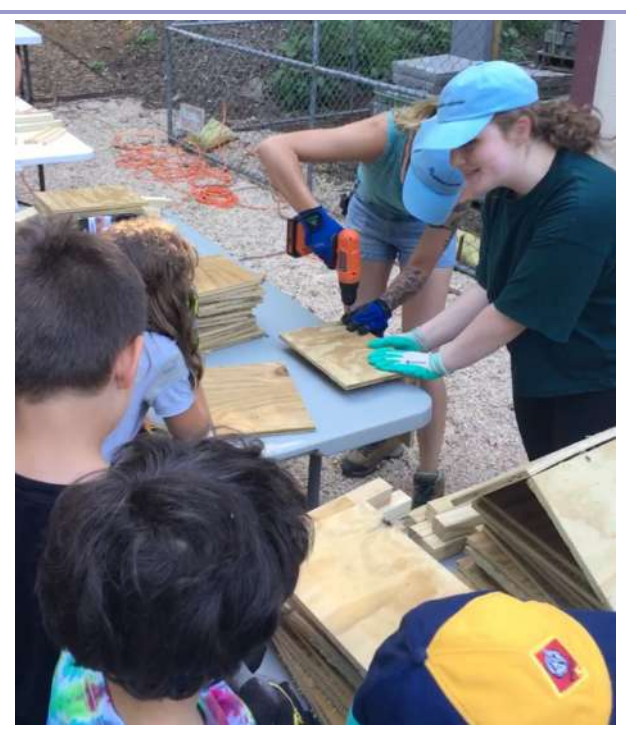
Least Tern volunteers in action!