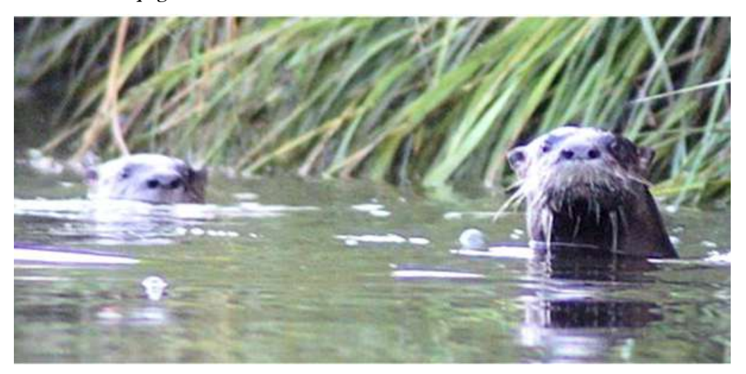
A pair of River Otters photographed in the Nissequogue River near Smithtown.